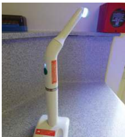
Special bright curing light.