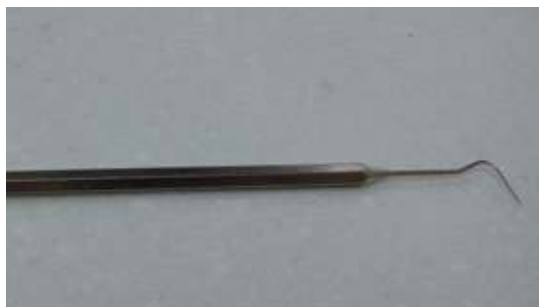
Probe - this is to count your teeth.